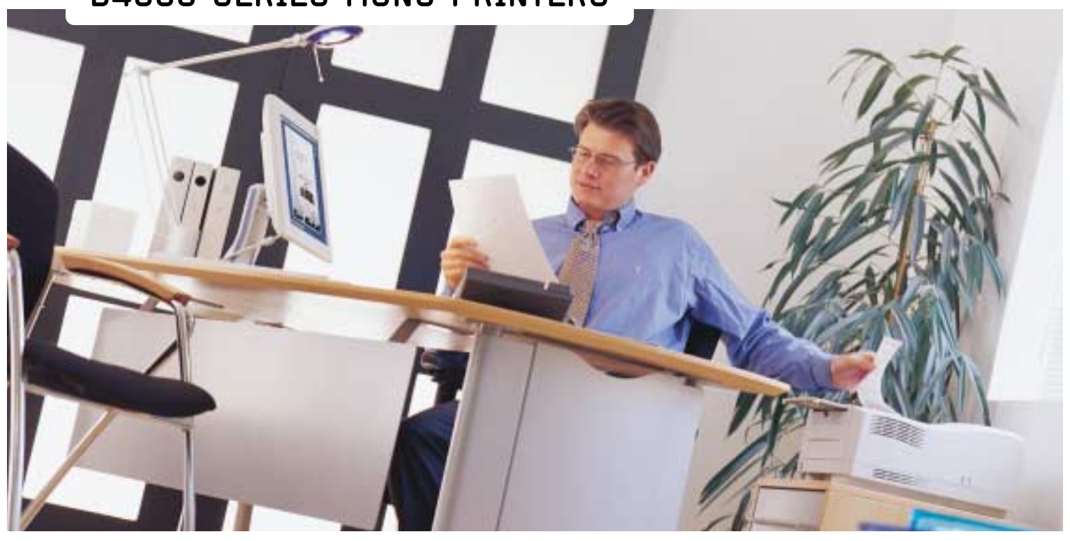
B4100: Personal printing for professionals

Mono printing is the engine room of a smooth running business, the unsung hero powering through the workload.