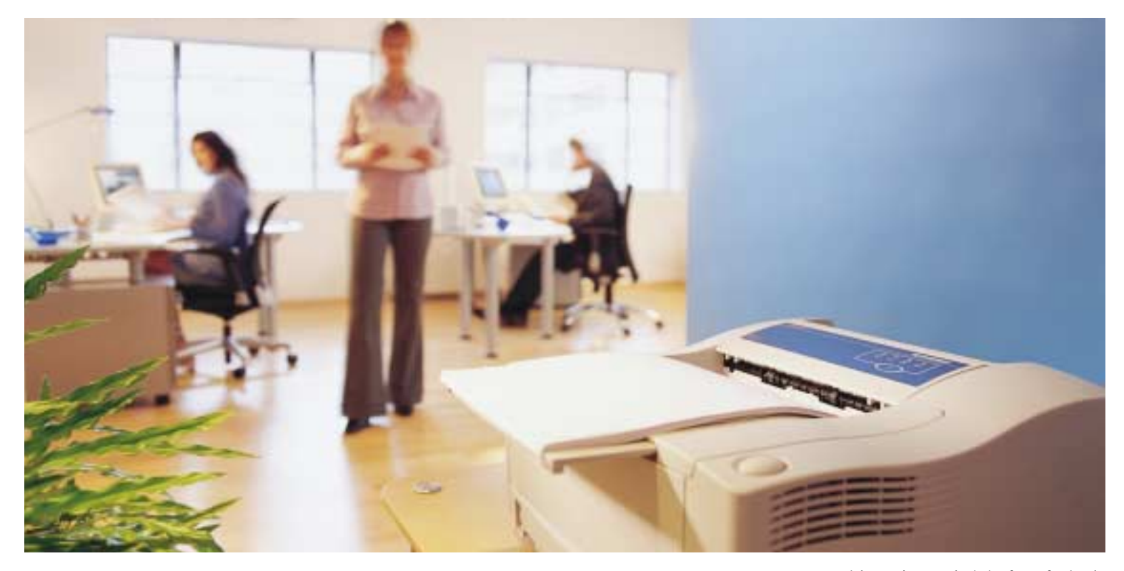
B4250: High-speed personal printing for professionals