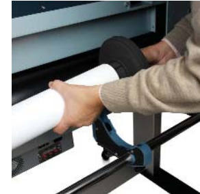
Easy media loading